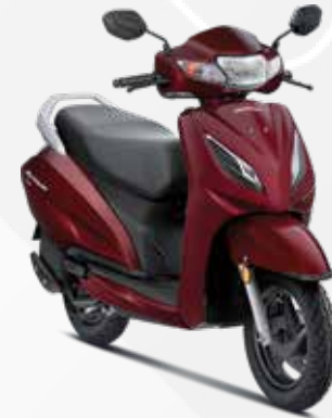
Rebel Red Metallic

Honda Motorcycle and Scooter India Pvt. Ltd.